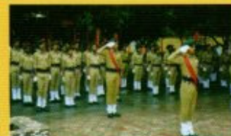
National Cadet Corps Saluting National Flag