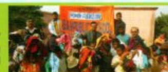
Distribution of Clothes to the deprived students

The very foundation of DAV is based on selfless service for the downtrodden. We, DAVians carry forward the same social work by providing free education & study materials to the students hailing from economically backward community under RTE Act 2009. Every year, come winter DAV school distributes winter clothes to the deprived and have nots especially those who are living on the edge.