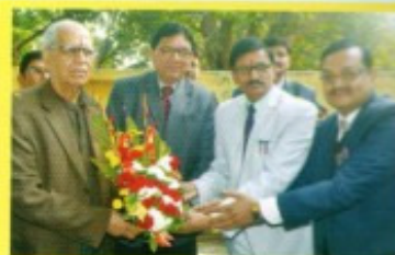
August Presence of Hon'ble Secretary, DAV CMC, Reg. Director, Ranchi Zone & Reg. Director JH-SP Zone

I take this opportunity to present before the august audience, the imitable achievement of our institution in the ensuing session 2019-20.