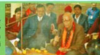
Hon'ble Secretary, DAV CMC addressing in Hawan

Every child is like a seed that needs the care and nourishment of not only the parents but also the teachers whom they meet in their second home. For moral and spiritual upliftment every Saturday with the holy chanting of vedic hymns, our children relive & revive the ageless vedic tradition through hawan, bhajan & sermons. The clarion call given by the founder of Arya Samaj Swami Dayanand Saraswati 'Back to Vedas' & 'Nature' is found in the aura of this school.