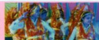
Artists' talent with Rajasthani Folk

Our school puts special emphasis on Music & Dance. Music classes are compulsory upto secondary classes. In the last session 2018-19 our school participated at the district level cultural program & the dance team of the school was awarded by Hon'ble DC, Pakur.