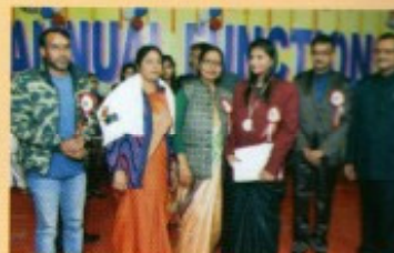
Hon'ble D.D.C., D.E.O., District & Session Judge, Pakur blessings the student