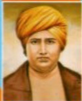
Dayanand Saraswati (Founder of Arya Samaj)