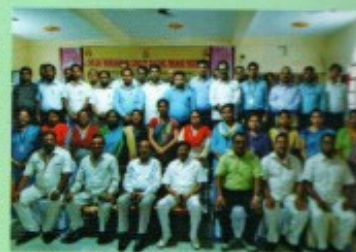
Capacity Building of Karmayogi Teachers

Co-Scholastic activities are inevitable part of modern education. DAV institutions lay paramount importance to the need of the students. Every year sports & games are conducted by DAV CMC New Delhi - first zonal basis leading to national basis. The school conducts co-curricular activities through different houses viz: DAYANAND, AUROBINDO, VIVEKANAND & SHARADHANAND HOUSE to bring out the co-scholastic & creative talents of the students, so that their skills in co-curricular fields can be sharpened. Yoga, Martial art like Karate, different Olympiads in Science, Maths, English Language, GK and Reasoning were conducted and meritorious students were rewarded. Art and Science exhibitions were also organized to uplift the craftsmanship & scientific temperament. For capacity building of teachers, our school organized three workshops under DAV Centre for Academic Excellence, New Delhi.